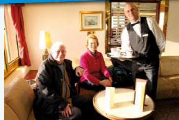
Enjoying Club Class luxury on the ferry