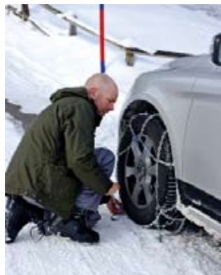
Snow chains proved to be vital

Comparable holiday by air and self-catering chalet: £1800