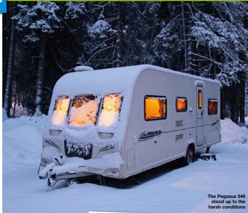
The Pegasus 546 stood up to the harsh conditions

grateful that I had brought snowchains from Halfords and had such a fantastic and confidence-inspiring car.