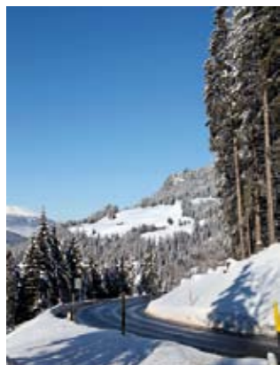
Alpine roads were fine for the Volvo