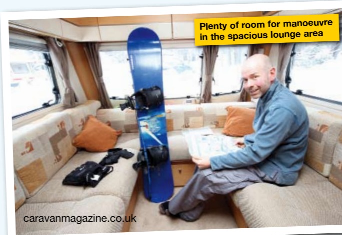
Plenty of room for manoeuvre in the spacious lounge area

Thank you to: Bailey Caravans for the loan of the Pegasus. Volvo for the loan of the amazing XC60. Caravan Club Travel Service for arranging the ferry crossing and Red Pennant breakdown insurance. Alan Rogers/Camping Cheques for supplying Camping Cheques for our sites en route. Lenzerheide Tourism for their assistance. Milenco for supplying grip mats, noseweight gauge, and security devices. Halfords for sourcing our snow chains and supplying overseas touring essentials. Touring Club of Switzerland for their hospitality at their Lenzerheide site. P&O Ferries for their hospitality on board their fabulous ferries.