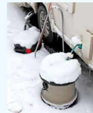
The Aquaroll did freeze, though

RESULT Six people may need a roof box on the car. But for three of us there was more than enough space, mainly thanks to the numerous roof lockers and fold-up lower bunk.