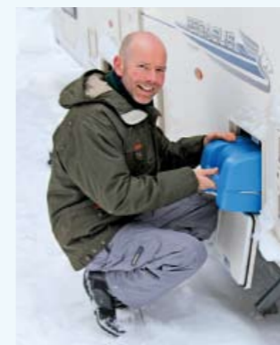
The fresh water tank didn't freeze

had a problem with fresh water. But the kitchen waste water froze in the pipe, leaving us with the washroom sink only.