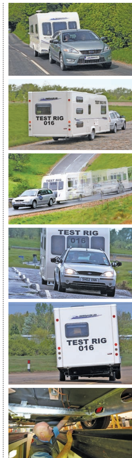
Pictured from top: Pegasus on the road; all the prototypes were subjected to being towed over a section of Belgian pavé – replicating some of the worst roads in Europe; the speed test at the Millbrook Proving Ground; speed humps like you've never seen before; the potholes at Millbrook are far more severe than anything a caravan is likely to meet on normal roads; at regular intervals during testing, the caravans were given a thorough inspection by Millbrook staff