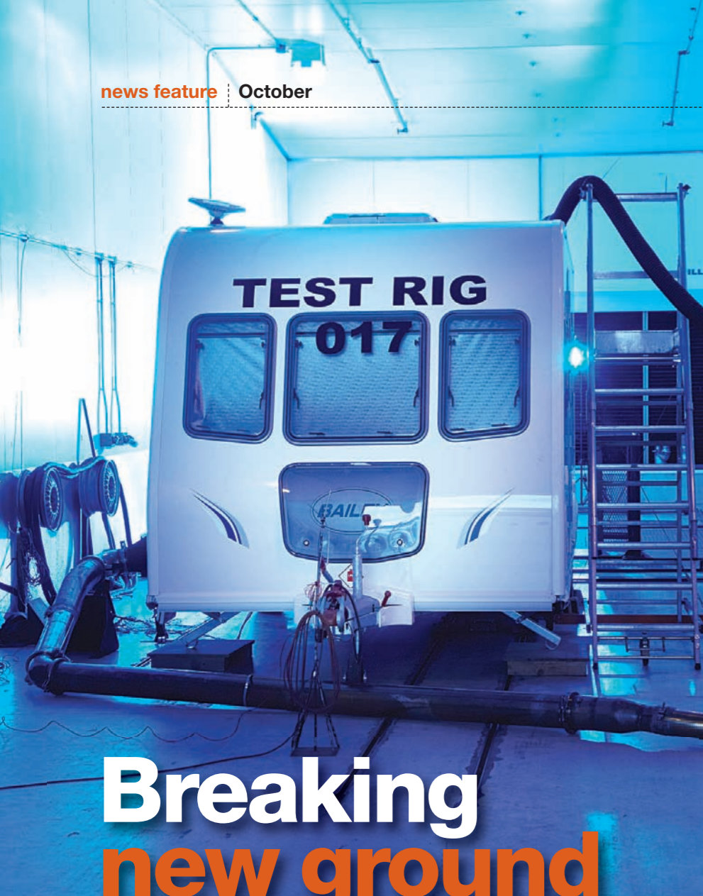
Left: Each prototype underwent thermal grading testing in the cold chamber at the Millbrook Proving Ground. Below: A thermal image of the heat losses from one of the Pegasus prototypes during cold chamber testing. Bottom: Demonstrating the strength of the unit